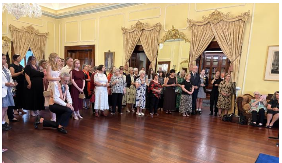
The crowd at Government House