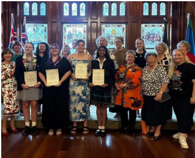
Our Club members and awardees