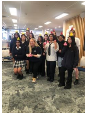
2024 Young Leaders group with their 'CAN DO' ducks.