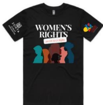
STYLE 3 Women's Rights are Human Rights Black Tshirt