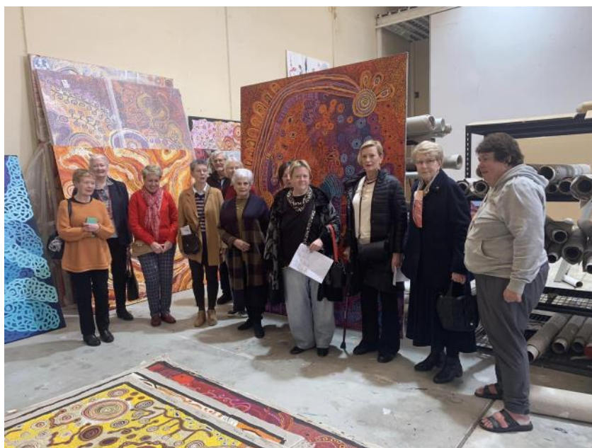
Our end of Women Artists talk with a tour of the APY Gallery in Thebarton and lunch at Nest