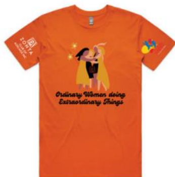
STYLE 2 Ordinary Women doing Extraordinary Things Orange Tshirt