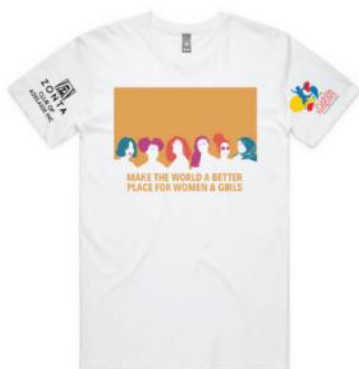
STYLE 1 Make the World a Better place for Women & Girls White Tshirt